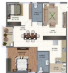
2 BHK EAST 1125 SFT.