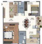
2 BHK WEST 1125 SFT.