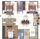
3 BHK WEST 1368 SFT.