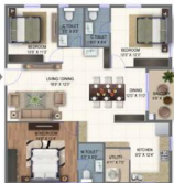
3 BHK WEST 1620 SFT.