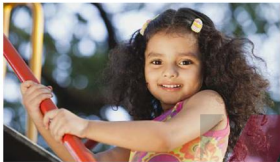
Tot lots and Children Play Areas