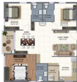
3 BHK EAST 1620 SFT.