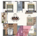
3 BHK EAST 1368 SFT.